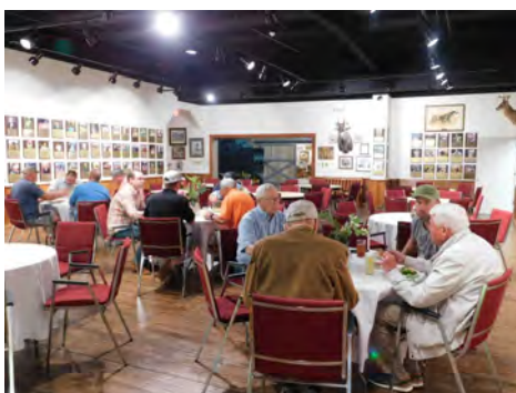
GSP meeting and luncheon June 4, 2022