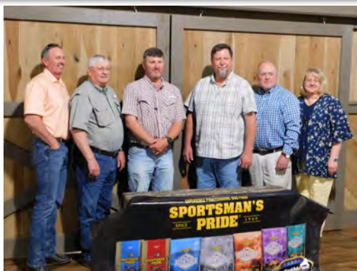
Officers of Region 6 AFTCA