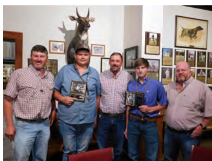
AFTCA Sportsmen of the Year with friends